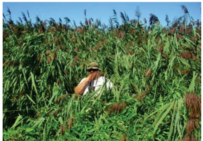
Common Reed ( Phragmites )

Two new organizations, the Great Lakes Phragmites Collaborative, based in Michigan, and the Ontario Phragmites Working Group, have emerged to educate the public and share techniques on managing the invasive reed. A new document by the Ontario Ministry of Natural resources called "Invasive Phragmites -Best Management Practices of Phragmites is available that provides a selection of effective and environmentally safe control practices. For more information on Phragmites , see http://www.mnr.gov.on.ca/ .