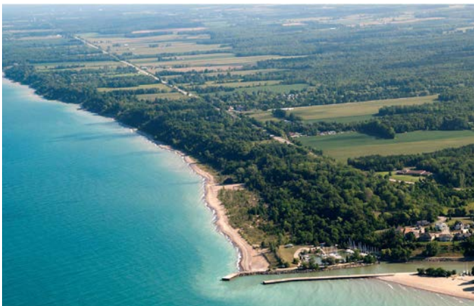
Lake Huron Southeast Shores

The Michigan Agriculture Environmental Assurance Program (MAEAP) has also been working with farmers in the Saginaw Bay watershed to identify and manage environmental risks by implementing best management practices on farmland since 2002. To date, more than 240 verifications (i.e., environmental-related assessments) have been completed in the watershed. For 2013, 11 MAEAP technicians will provide local technical assistance to the Saginaw Bay watershed.