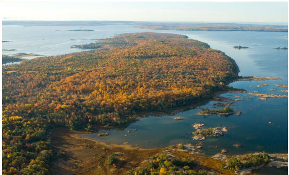
Georgian Bay

We encourage you to learn more about Lake Huron and the collaborative approaches taken to understand its ecosystem, how we are protecting high quality areas and restoring areas that have been degraded. For more information visit: www.binational.net .