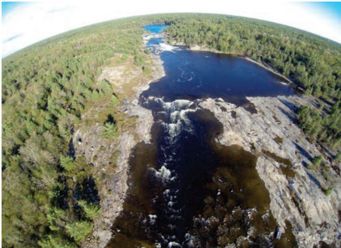
Moon River habitat restoration project

in 2013 confirmed the use of new spawning habitat by Walleye. This work is an ongoing collaborative effort with funding from the province, municipalities and private donors. The Key River is the next tributary being considered for Walleye spawning bed improvement.