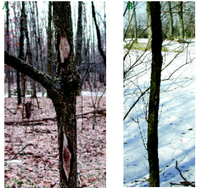
A: Stem cankers caused by Discula destructiva on Cornus florida . B: Epicormic shoots produced by dogwoods weakened by D. destructiva .